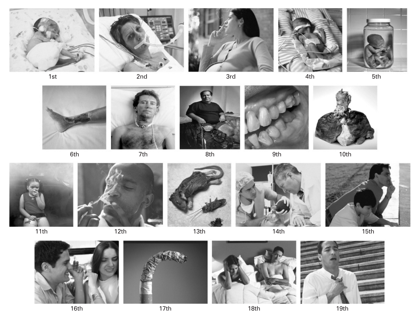
Figure 2 Brazilian warning pictures. The ranking order along the defensive vector is shown below each picture. Picture 1 is the most aversive and picture 19 is the least aversive.

(F(1,208) = 26.57; p<0.05). Post-hoc analysis showed that smokers judged the warning pictures with smoking scenes significantly more pleasant than did non-smokers (p<0.05). Smokers also considered those pictures significantly more pleasant than the ones without scenes of people smoking (p<0.05). For the (larger) group of pictures without people smoking, there were no significant differences between valence judgements by smokers and non-smokers (p = 0.89). No significant interaction was found between "group" and "smoking scene" for judgements of pictures' arousal.