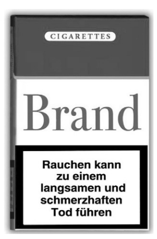
Fig. 1. Example of a selected pictorial and written warning. Note : translation: "smoking can cause a slow and painful death." For legal reasons, in this publication the brand and logo from cigarettes packages were concealed and replaced with the name "Brand". However, in order to design the experiment as realistically as possible, for the experiment pictorial warnings on authentic cigarette packages were kept. Four of Germany's most popular cigarette brands were used for this purpose.