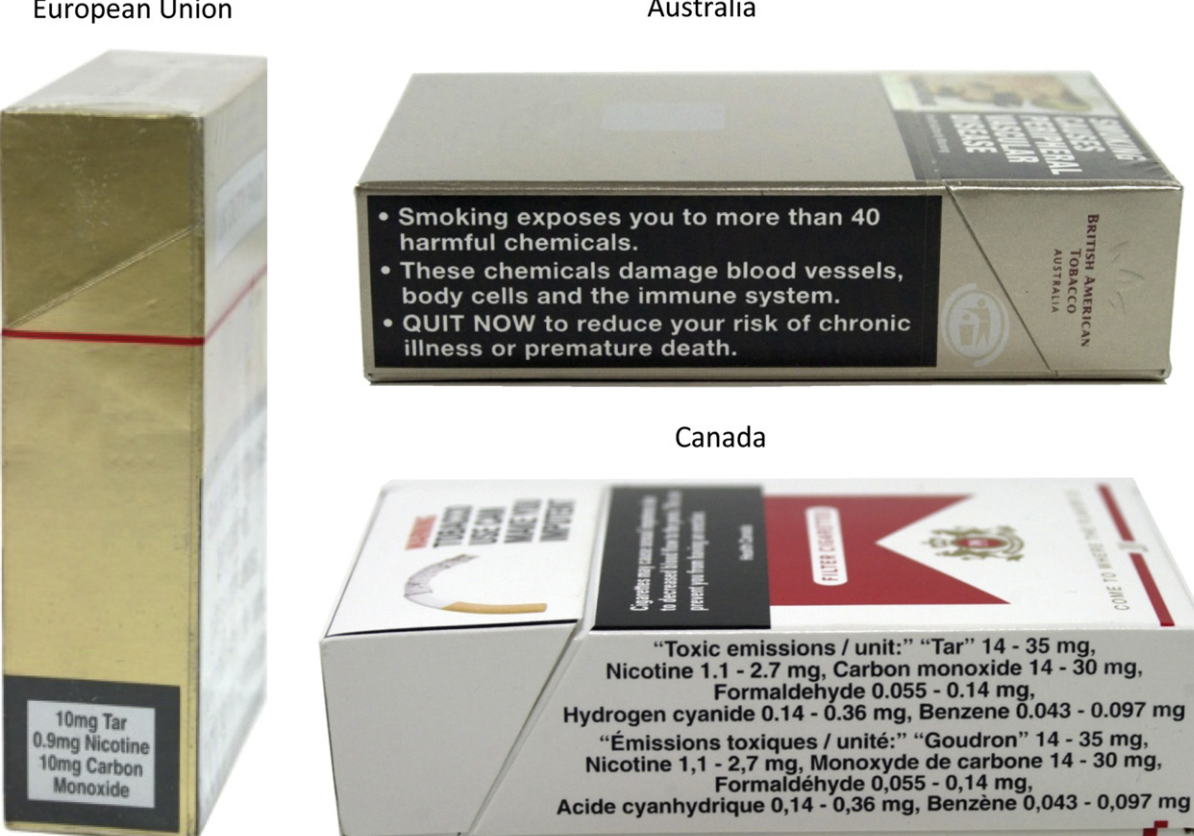
Figure 1 – Example of emission labelling (2010).

In response to concerns about how consumers interpret emission numbers, jurisdictions such as Canada supplemented the emission numbers with additional information. In 2000, Canada increased the list of emissions that must be reported (tar, nicotine, carbon monoxide, benzene, hydrogen cyanide and formaldehyde) and added a second set of emission numbers generated under the Health Canada method, a more intensive machine-smoking method (see Fig. 1). This emission testing method is no better at predicting exposure or risks than the lower set of numbers, but was intended to communicate that each product could deliver a range of chemical amounts.<sup>12</sup> Other jurisdictions, such as Australia, have removed emission numbers from packets and replaced this information with descriptive statements on emissions