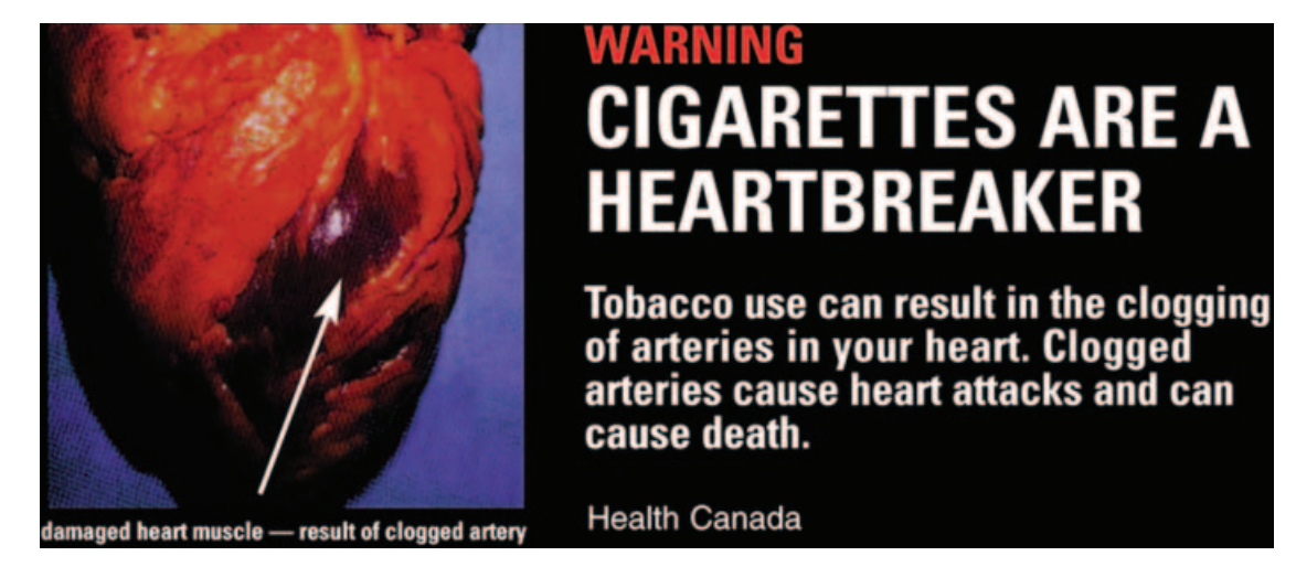
Figure 1. One of 16 warning labels used on cigarette packages in Canada.

Survey research in Canada suggests that the larger labels with color pictures and 16 separate messages about specific risks of smoking create more negative emotional associations with cigarettes and increase smokers' attempts to quit (Hammond, Fong, McDonald, Brown, & Cameron, 2004; Hammond, Fong, McDonald, Cameron, & Brown, 2003). However, this research relies on smokers' reports of exposure and attention to the labels. As noted by one